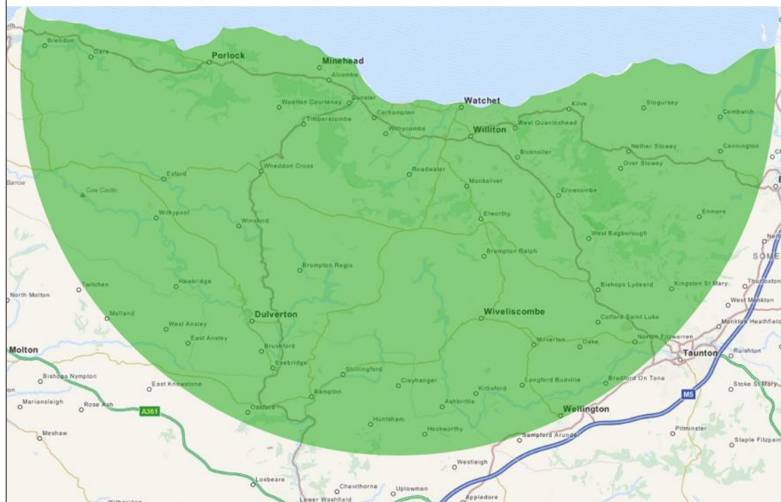
Map Showing Area for Local Entries (15 miles as the crow flies from the showground)